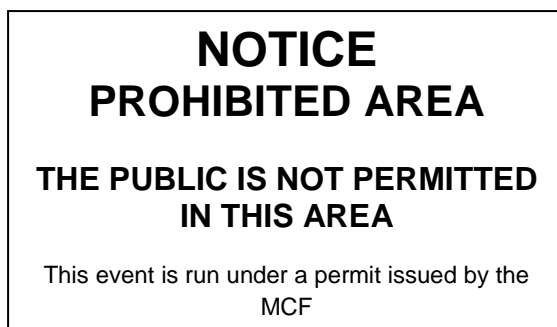
Warning Notice (MCF2)