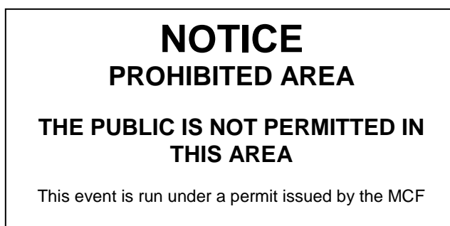
Warning Notice (MCF3)

Those parts of the course to which the public is not admitted and where it is neither practical nor necessary to erect a rope barrier, may be indicated by the erection of the special type of Warning Notice (C). These notices mounted on stakes with the top of the notices at least 1.2 metres above ground level should be displayed at least 20 metres from the course. The limit of these areas should also be defined by a boundary tape affixed to the stakes supporting the notices.